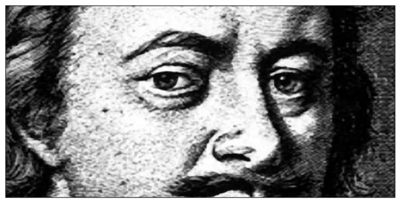
Figure 3: Peter' eyes, detail, from Robert Massie's "Peter the Great", after p. 210