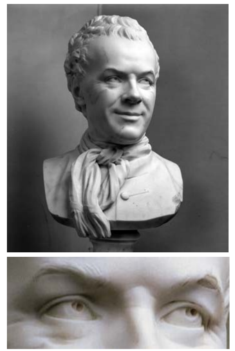
Figures 10 & 11: Collot, Marie-Anne, Falcone, Etienne-Maurice, Etoeva p. 207