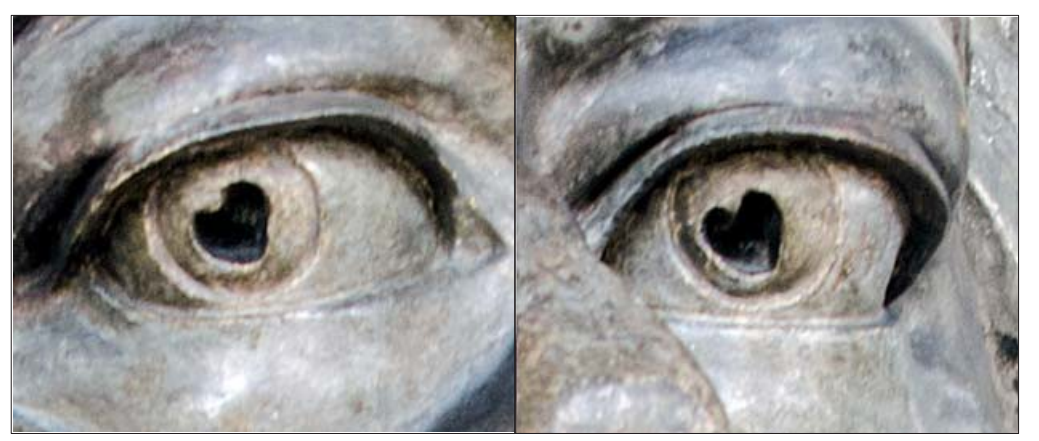
Figure 2: Pupils close up, Peter's bust, Russian State Museum, St. Petersburg,