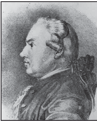
Joseph Jacob Plenck

Plempius, Vopiscus Fortunatus (1601-1671). Born at Amsterdam, and professor at Louvain (Leuven), he was at first a bitter opponent of Harvey, but later presented a complete right-about-face, warmly supporting, then, the doctrine of the circulation of the blood. He was a very prolific writer, but none of his works, save one, relates to ophthalmology. The book in question is entitled " Ophthalmographia, sive Tractatio de Oculi Fabrica, etc. " (Amst., 1632; Louvain, 1648). This book is not especially original, but is memorable nevertheless for being the very first (after 28 years even so) to espouse the revolutionary, and, for the most part, absolutely correct, optical doctrines of Johannes→Keppler (q. v.). American Encyclopedia of Ophthalmology 13,p.10259