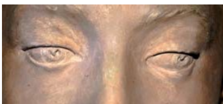
Figure 12: Collot, Marie-Anne, Lady Mary Cathcart, Louvre, 1768, 2014, photo by Jacques de Caso 2014