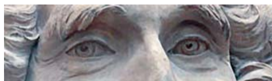
Figures 8 & 9: Falconet, Etienne-Maurice, Camille Falconet,