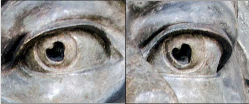
Figure 2: Pupils close up, Peter's bust, Russian State Museum, St. Petersburg,