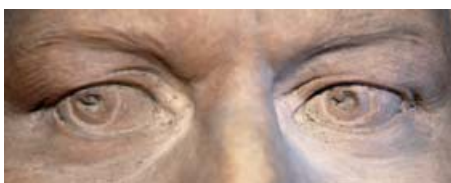
Figure 13: Collot, Marie-Anne, Etienne-Nöel Damilaville (?), 1765, Louvre