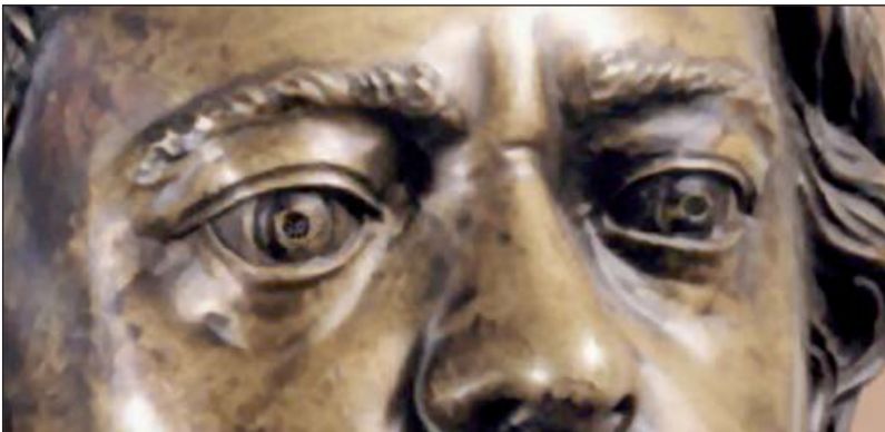
Figure 4: Rastrelli, Carlo Bartholomeo, Peter's pupils' details, from Getty web site

lightenment circle and taken her to the Russian Court in St. Petersburg. Her commissions there had made her very wealthy.