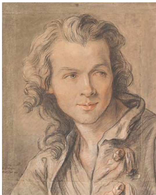
Figure 14: Lemoyne, Jean-Baptiste, Falconet, Etienne-Maurice, 1741 Drawing, Metropolitan Museum of Art

Both Collot and Falconet lived remarkable, closely interwoven lives. She moved in with him at age 16, and aside from a couple of years, lived with him until his death. Both were born poor and achieved considerable acclaim as sculptors, Falconet being ranked among the first rank of sculptors of his era.