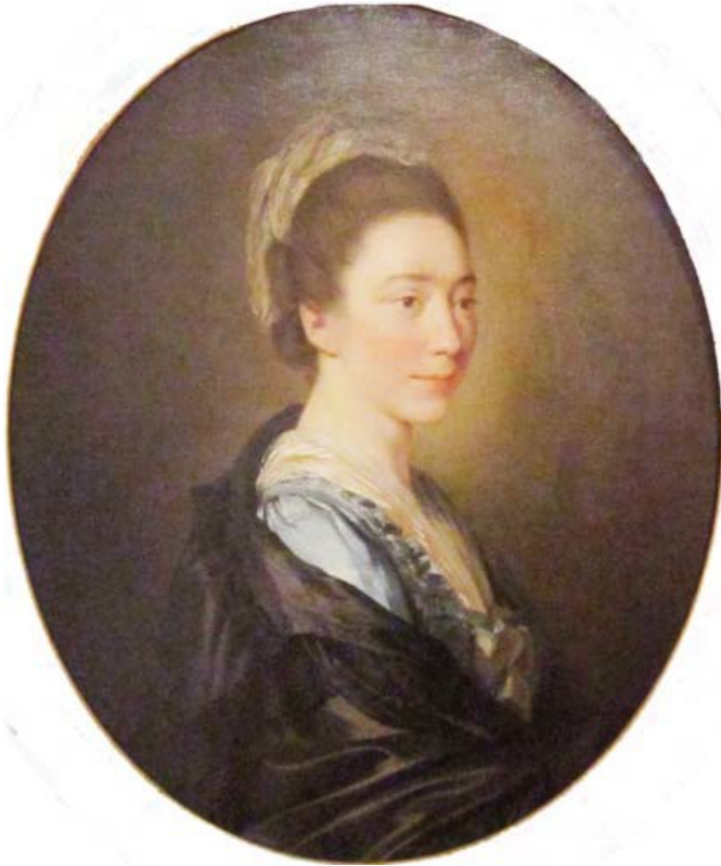
Figure 15: Falconet, Pierre-Etienne, Collot, Marie-Anne portrait, Musée des Beaux-Arts de Nancy

hers described him as egocentric, short tempered, aggressive, prickly, hypersensitive, and hypercritical, characteristics often impeding his achieving his career goals. His personality led both Diderot and Catherine to break with him late in his Russian stay. As a result neither he nor Collot were invited to the unveiling of the Bronze Horseman..