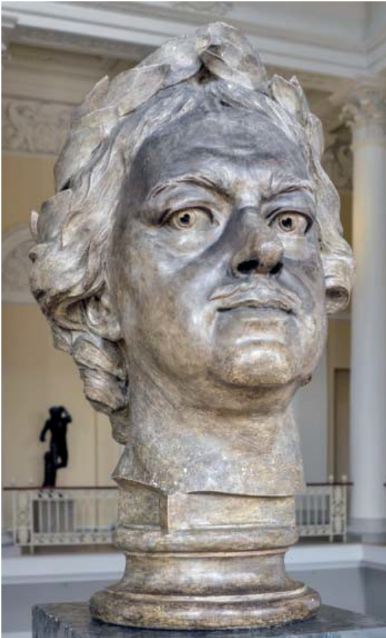
Figure 1: Collot bust of Peter the Great, Russian State Museum, St. Petersburg,

The bust of Peter the Great created by Marie-Anne Collot, a young Frenchwoman, assistant to Etienne-Maurice Falconet, has heart shaped pupils. These resemble posterior synechiae. Collot began an apprenticeship with Falconet when she was 16 years old and he, 48. She was exceptionally talented. He took her with him to Saint Petersburg to help create Catherine the Great's massive monument to her predecessor, Peter the Great. Collot lived with Falconet nearly every year from the time she joined his atelier until his death. This intimate relationship led to a legend that holds the bust's heart shaped pupils represent Collot's romantic love for him. This legend will be analyzed in this paper.