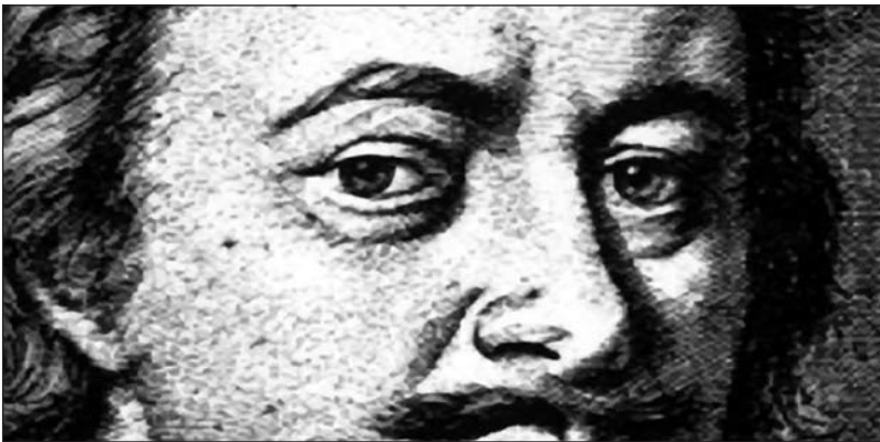
Figure 3: Peter's eyes, detail, from Robert Massie's "Peter the Great", after p. 210