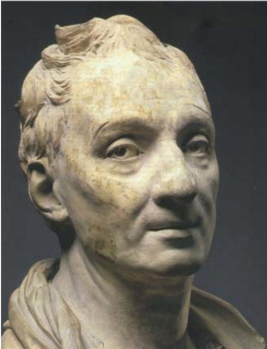
Figure 16: Collot, Marie-Anne, Denis Diderot,